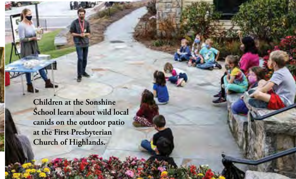
Children at the Sunshine School learn about wild local canids on the outdoor patio at the First Presbyterian Church of Highlands.