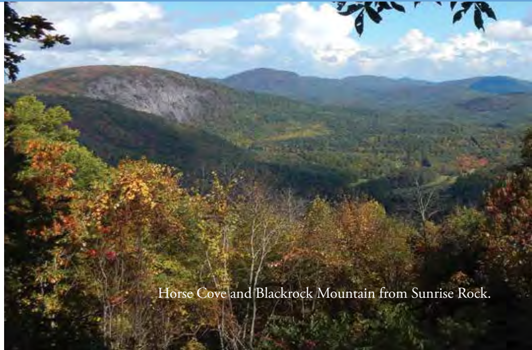
Horse Cove and Blackrock Mountain from Sunrise Rock.

Tim and Emily Campbell, long time conservation partners, are donating a 6.7-acre farmlet on Salt Rock Road next to an existing 12-acre tract we already