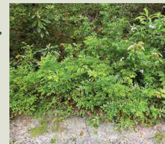
The invasive multiflorarose.