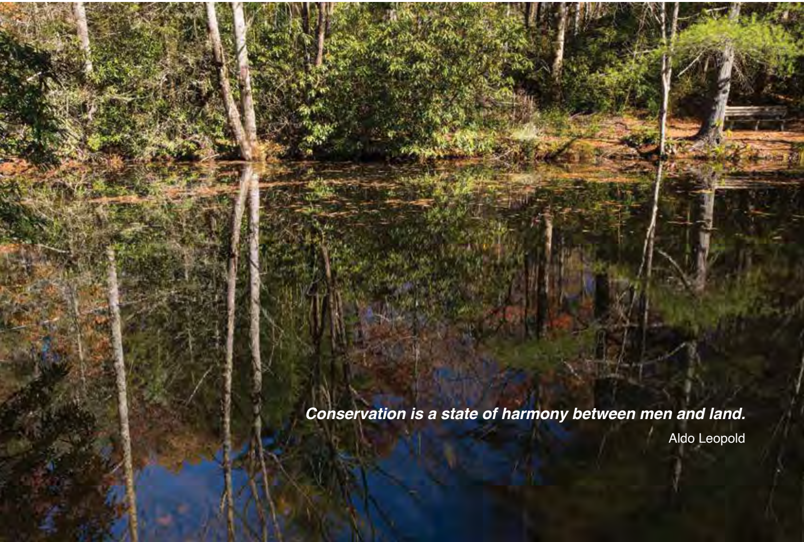
Photo of Dixon Pond

Conservation is a state of harmony between men and land.