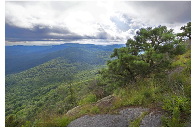
View from Satulah Mountain.

Enjoy the natural beauty of the Highlands-Cashiers Plateau by hiking on our conserved lands.